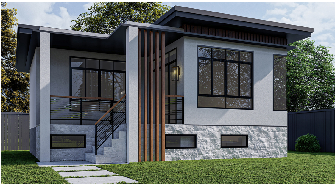
“The Ontario” model - recessed garden suite concept from Laneway Housing Advisors

The new building is a mostly-autonomous auxiliary dwelling unit, normally up to 6.0m (19.68 feet) tall, that cannot be legally severed from the main property, but is permitted a wide variety of uses, including as a revenue-producing (rental) unit. Where practical, some will have optional indoor vehicle parking.